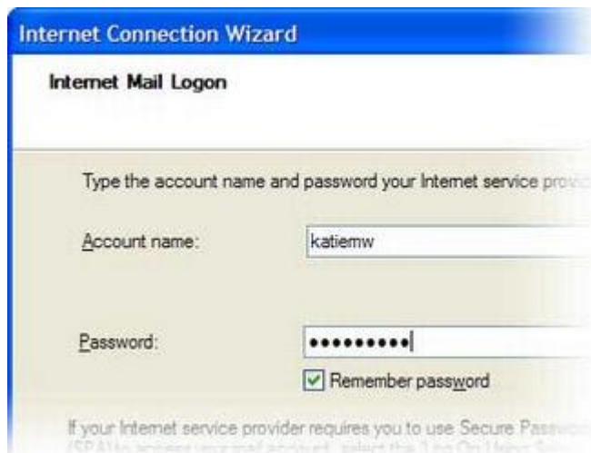
Internet Connection Wizard's Internet Mail Logon

7. On the Internet Mail Logon page, type your account name and password.