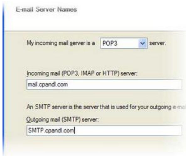
Internet Connection Wizard's E-mail Server Names

gathered from your ISP in step 1, and then click Next .