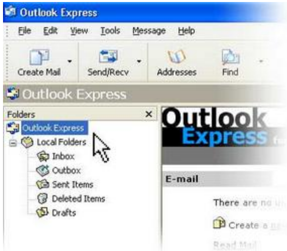
Outlook Express list of folders