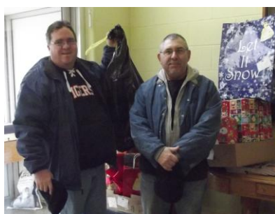
Making out of town deliveries

Your generosity provided over 100 gifts to children for the Prison Angel Tree Project in 2011.