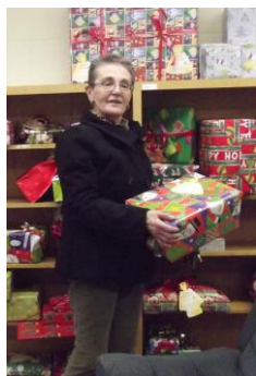
Bringing a gift