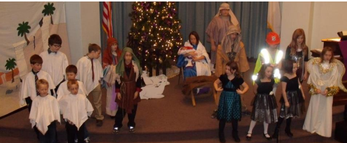
Children, youth, and adults shared their gifts of singing, reading, and acting in worship on 12/12.