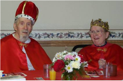
Valentines and visited with residents.

PRAIRIE VIEW CARE CENTER 401 South First Avenue PO Box 68 Woonsocket, SD 57389