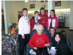
The PVCC Gang enjoying the flowers from the 4-H Club. (far right)