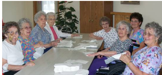
Helping out the community with The Relay For Life luminaries