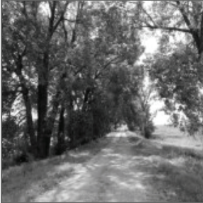
TREES IN RIGHT OF WAY