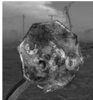
UNREADABLE STOP SIGN

This checklist is not intended to be all-inclusive...and hopefully these reminders with the explanations will serve to make your job more understandable and easier for you. Remember we are all in this together... and if someone knows of a better or easier way just let me know and I will pass it on!